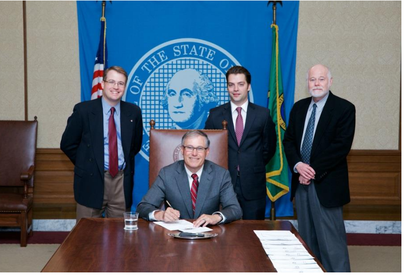
Governor Jay Inslee signing SB 5180 May 14, 2013