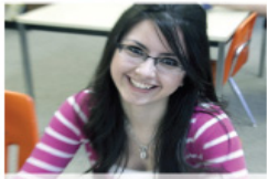
I AM IN HIGH SCHOOL

Of eligible 8th graders signed up for College Bound as of Oct. 2014. Four-year college graduation rates are over 15% higher than their peers.