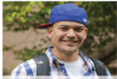
I AM IN COLLEGE

Of Achievers Scholars graduated on time from high school and exceed their peers in college enrollment.