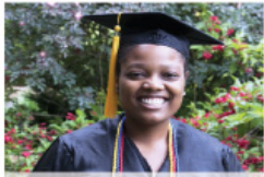
I AM A CSF ALUMNI

CSF Scholars have over TWICE the odds of graduating from college within 6 years compared to low-income graduates.