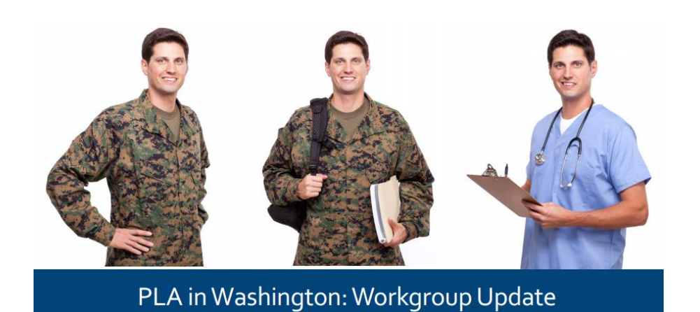
Prior Learning Assessment